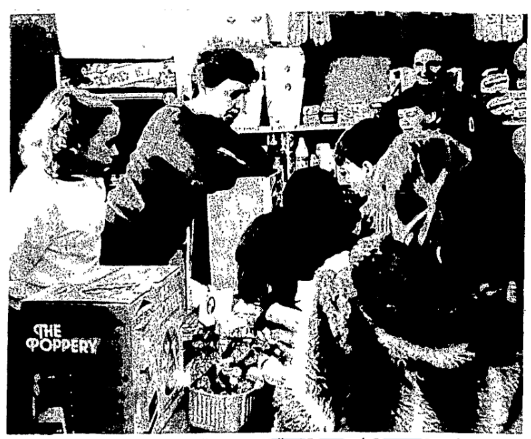
CROWD GATHERS for Pepsi Challenge at Hellers Town and Country Grand Opening which was held Friday and Saturday.